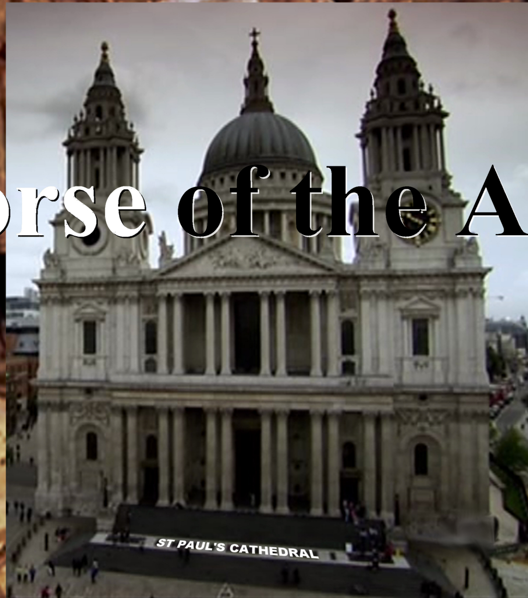
Slaughter House Religion