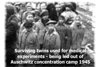
Surviving twins used for medical experiments - being led out of Auschwitz concentration camp 1945

At the height of imperialist Europe, the Englishman Charles Darwin in his ignorance proposed that life only happened by chance. Evolution is a religion of blind faith in blind chance, a pseudo-science that genetic data as prescriptive information for a physical outcome dispels. Consider the history and social impact of Charles Darwin's theory of evolution. The old Social Darwinism of western Imperialism says you must kill other people's children to create a prosperous world where your own children are 'elevated man', the chief animal over all other animals as if everything and everyone else exists for your 'master race'! The Social Darwinism of Communism says you must kill your own