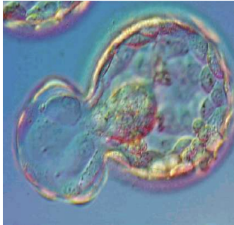
Monozygotic ('Identical') Twins Monozygotic (MZ) or identical twins occur when a single egg is fertilized to form one zygote, (hence, 'monozygotic') which then divides into two separate embryos.

see two children exactly the same age having the same physical features, but it all begins with the data in the DNA of the first cell. In the case of identical twins the mothers egg (for reasons unknown) cleaves over two of the first progenitor cells creating two separate embryos! Both babies will grow into adulthood as people who look identical