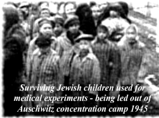
Surviving Jewish children used for medical experiments - being led out of Auschwitz concentration camp 1945