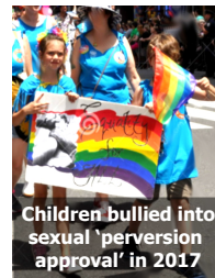
Children bullied into sexual 'perversion approval' in 2017

Like all Social Darwinist dictators old and current, Hitler's invasion of the personal privacy of children in the 1930's is the same totalitarian invasive influence of today. He used the same means, only now the pornography of power that is state propaganda has morphed from Nazi political perversion into perverted gay activism for abnormal 'marriage' equality. It holds the endorsement of heads of state, heads of corporations, school teachers, even brainwashed parents, for the same reasons they submitted to the Nazis in pre-war Germany. Loss of privacy from childhood into adulthood offers not just money but real power through Internet connectivity to both secular governance and corporate commerce. The normal value of personal privacy that when shared makes friendships cleave together, collapses in the motive centre of people who are isolated and conditioned by unfettered consumerism. The 'system' becomes an atheistic 'blind faith in blind chance' mentality of boldness into the unknown by a herd of 'Star Trek' lemmings, charging towards an abyss in wilful ignorance of tragic outcomes. The Social Darwinist mechanisms of power that were mass media in the 1930s and that were used to bring Hitler to