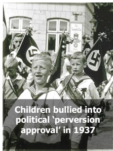
Children bullied into political 'perversion approval' in 1937