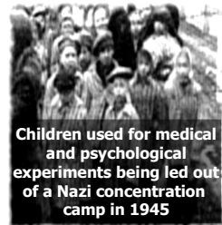
Children used for medical and psychological experiments being led out of a Nazi concentration camp in 1945